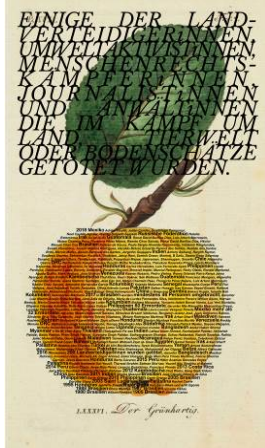
Ines Doujak from the series: Landraub , since 2018 © Ines Doujak