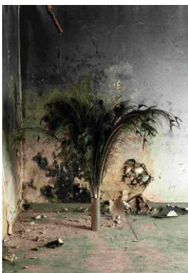
Ines Doujak Landschaftsmalerei , 2020 © Ines Doujak, Photo: Markus Wörgötter